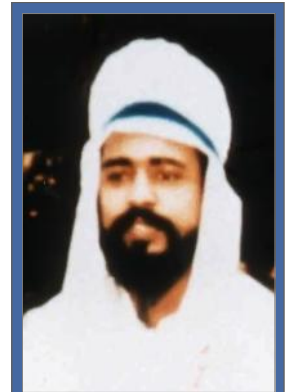
Maitreya, as he appeared in June 1988 to a crowd in Nairobi, Kenya.

Through these communications, Maitreya suggests the lines that social change must take, and evokes the desire to share and serve humanity. He also gives hints on how to recognize him and urges people to make known the fact of his presence.